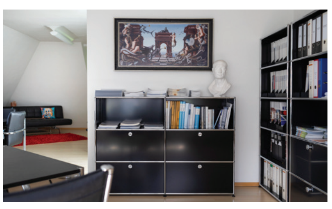
The new office can also be used for meetings. It has already been used for this purpose in the past.