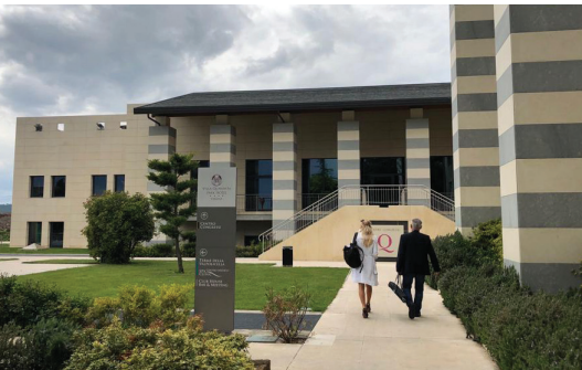
Entrance to the VILLA QUARANTA TOMMASI WINE HOTEL & SPA in Valpolicella/ Italy.

Oral implantology and modern dentistry will be on the agenda in Valpolicella (Italy) on 16 and 17 June 2023. In cooperation with the 16 th European Symposium of BDIZ EDI, the Giornate Veronesi—under the Italian sun, so to speak—will offer top-class scientific lectures, seminars and table clinics as well as a comprehensive supporting programme.