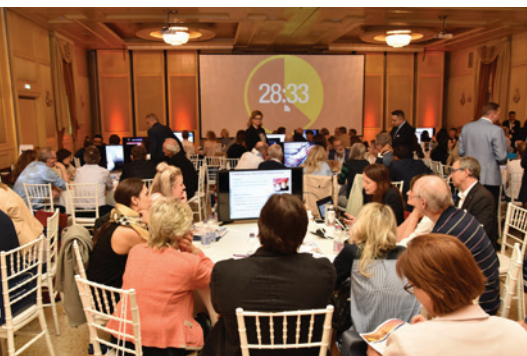
Like speed dating: the format of workshops.