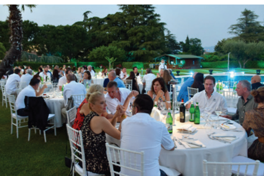
Beautiful surroundings to relax in the evening.

When it is cold, dark and grey in winter, it is time to think about the sun of Italy and a training event with that special Italian flair—the Giornate Veronesi (Verona Days).