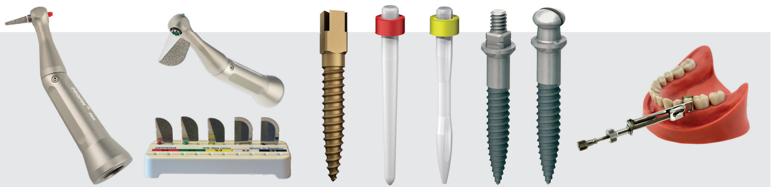
• From left: Profin reciprocating system, Complete IPR Solution (Profin PDX contra-angle handpiece with the IPR tips kit), gold Surtex Classic post, Luscent anchors, Dentatus Anew narrow-body implant, Atlas implant and matrix system.

For shaping, contouring and polishing natural dentition and cosmetic restorations with ease and flexibility, Profin is clinicians' system of choice. Profin consists of contra-angle handpieces and Lamineer diamond-coated tips. The handpieces move in an axial direction with reciprocating motion (1.2 mm stroke). Thanks to their thin design, the tips provide optimal access to areas that are difficult to reach, and the one-sided diamond coating promotes safety and control.