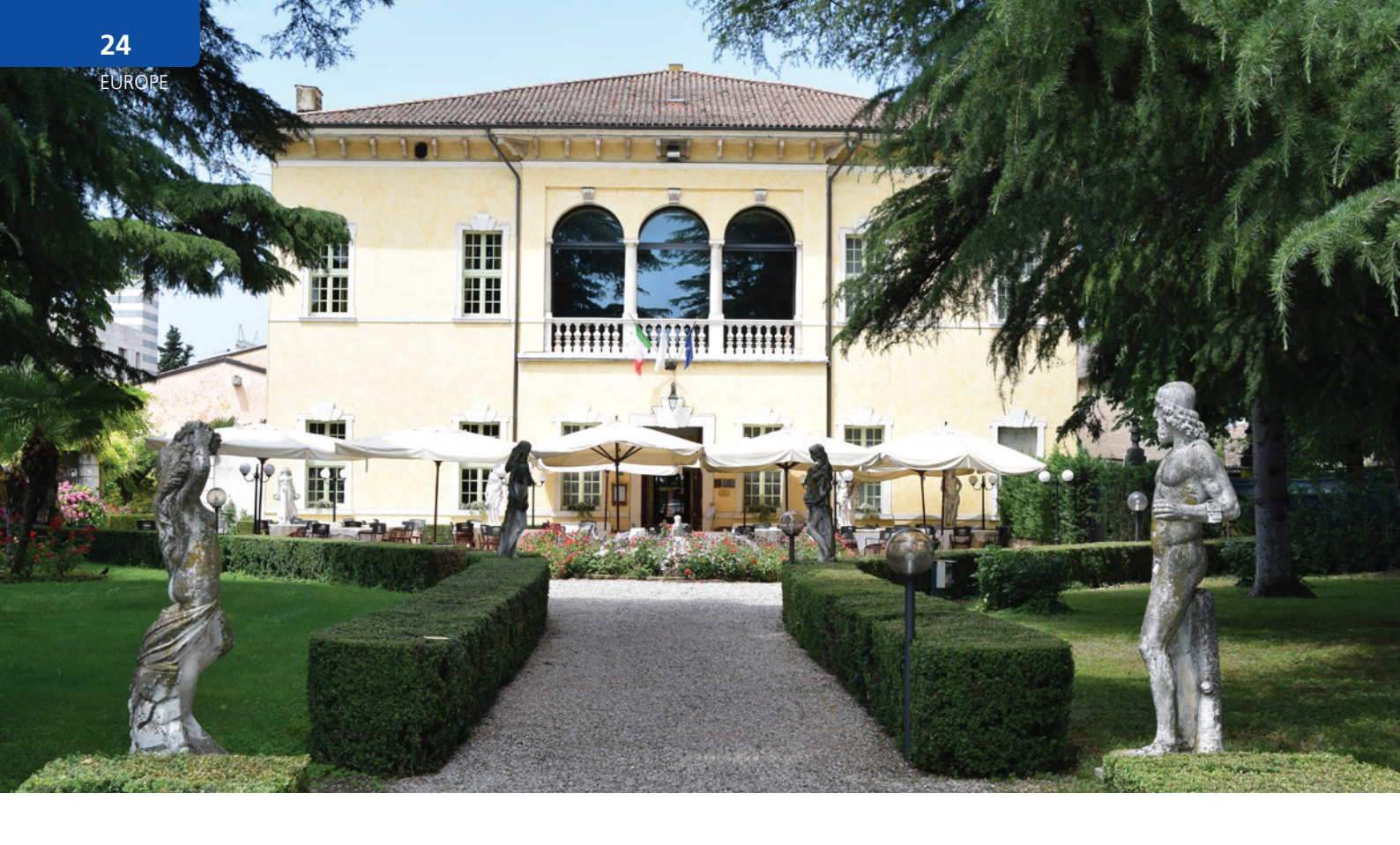
16th Europe Symposium and Giornate Veronesi 2023