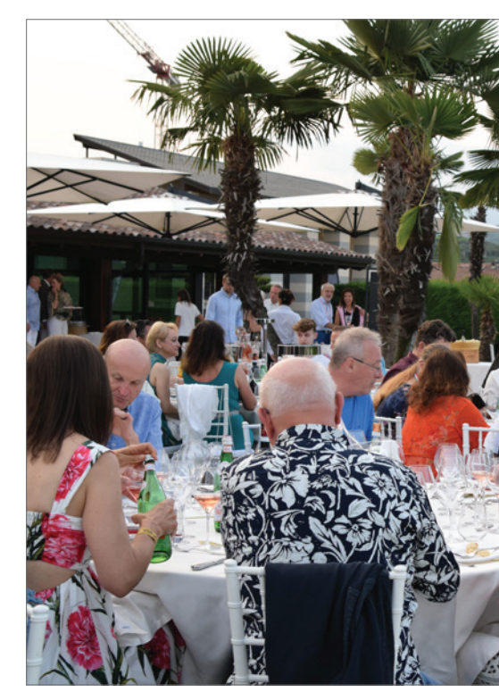
The symposium was also a culinary highlight.