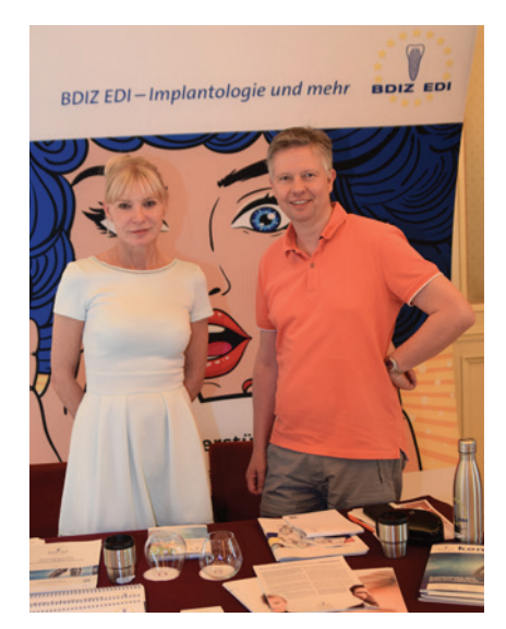
The BDIZ EDI was available to answer all questions from the participants.

Under the Italian sun, implantology and modern dentistry were on the agenda in the best weather in Valpolicella/Italy. The Giornate Veronesi 2023 once again offered a varied mix of scientific lectures, seminars as well as table clinics and scored a lot of points with the supporting programme. As an official cooperation partner of OEMUS MEDIA AG and the 16th Europe Symposium, BDIZ EDI was also in attendance.