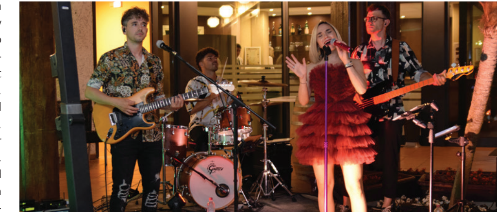
A live band provided the best party atmosphere in the evening