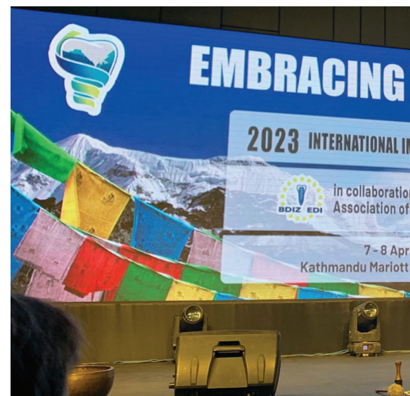
"Embracing the Future" was the topic of the Congress.