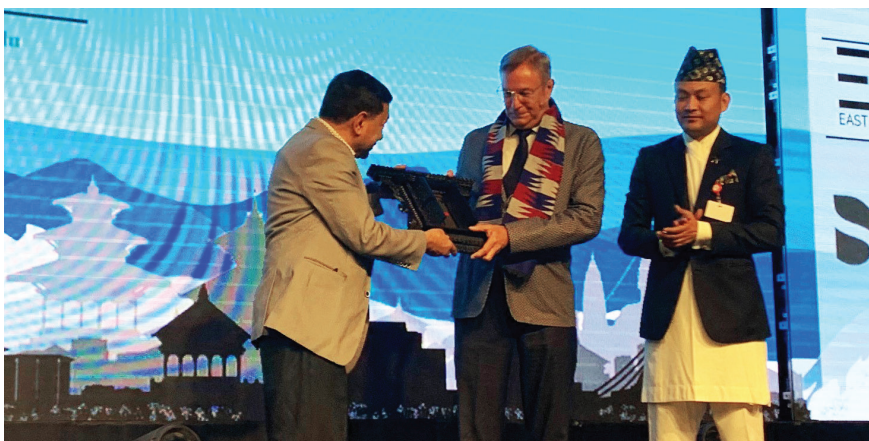
The official handover of the speaker certificate in Nepalese.