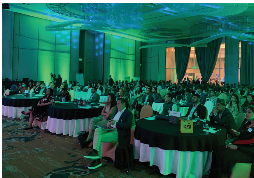
AWU Participants in the auditorium.