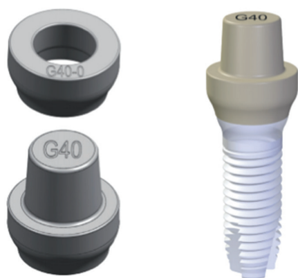
Fig. 3: PEEK protection caps for 1-piece implant (Z-Systems, Z5m).

analogue or digital impression, open or closed tray. Different brand-related scan bodies are available and here an implant analogue is always needed for the further laboratory handling. It is still of the highest importance to use the original components, delivered by the respective manufacturers, since printing of these individual components does not offer the same accuracy yet. 27