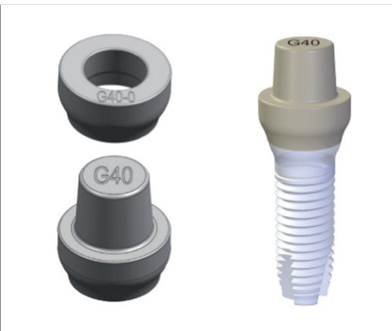
Fig. 3: PEEK protection caps for 1-piece implant (Z-Systems, Z5m).

analogue or digital impression, open or closed tray. Different brand-related scan bodies are available and here an implant analogue is always needed for the further laboratory handling. It is still of the highest importance to use the original components, delivered by the respective manufacturers, since printing of these individual components does not offer the same accuracy yet. 27