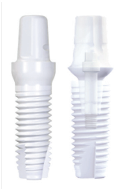
Fig. 1: A 1-piece and a 2-piece ceramic dental implant (Z-Systems: Z5m & Z5-BL).

Whereas ceramic implants are still relatively new, research has shown promising results in terms of their long-term success rates and durability.