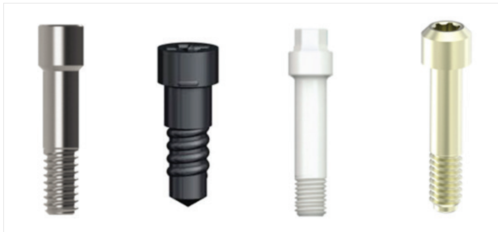
Fig. 2: Different abutment retention screws: titanium (Neodent)—carbon (Zeramex)—zirconia (Z-Systems)—gold (Camlog).

Whether 1-piece or 2-piece implants are installed, always low drilling speeds should be applied, surely when ceramic implant drills are applied. Drills made of ceramics don't conduct the warmth, leading to overheating of the bone in the osteotomy. 21 The latter doesn't lead to implant failure but induces significant crestal bone loss during healing and a final lower percentage of bone-to-implant contact. 22 These drilling speeds start around 800rpm for the first drills, reducing to 400rpm for the last drills. The advised tapping for D1-D2 (and D3) bone should be performed at 15rpm. 23