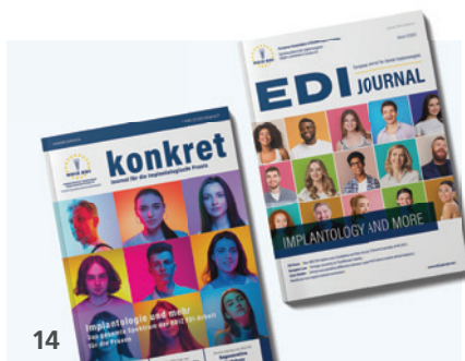
BDIZ EDI has an updated CI