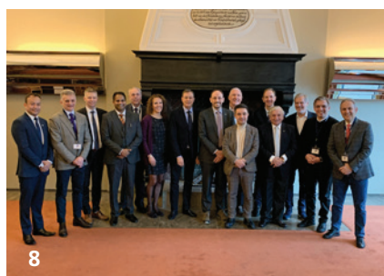
19 th Expert Symposium: Digital dentistry? Chances and limitations of current digital treatment approaches