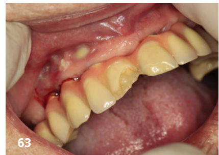
Clear and well-structured