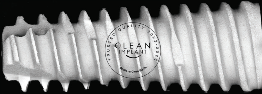
Dentis | s-Clean SQ-SL