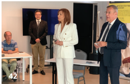
42 Impressions from the 17 th European Symposium in Split