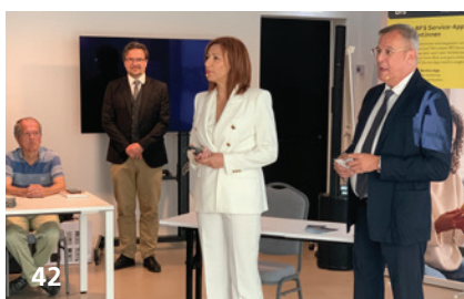
42 Impressions from the 17 th European Symposium in Split