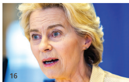
16 Ursula von der Leyen reelected President of the European Commission