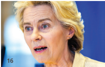
16 Ursula von der Leyen reelected President of the European Commission