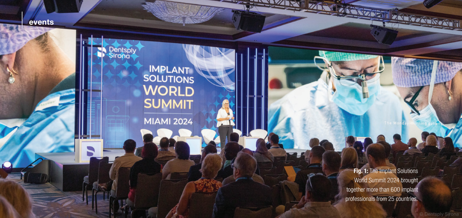
Fig. 1: The Implant Solutions World Summit 2024 brought together more than 600 implant professionals from 25 countries.