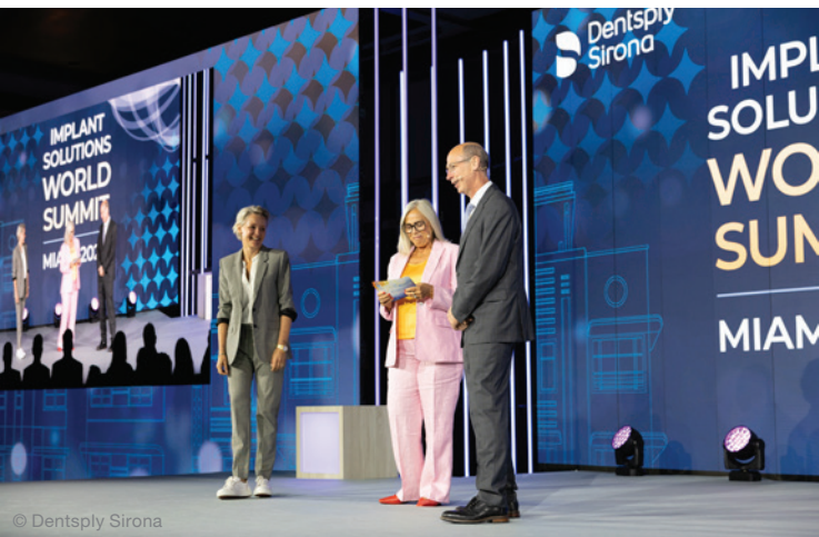
Fig. 3: Experts guided the audience through implant dentistry topics in the scientific programme.