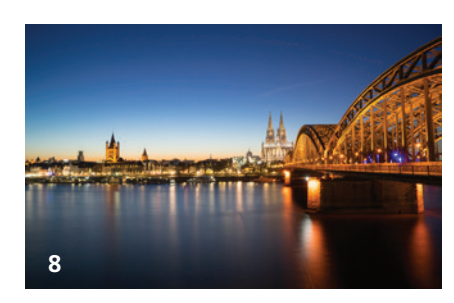
BDIZ EDI celebrates 20 years of the Expert Symposium