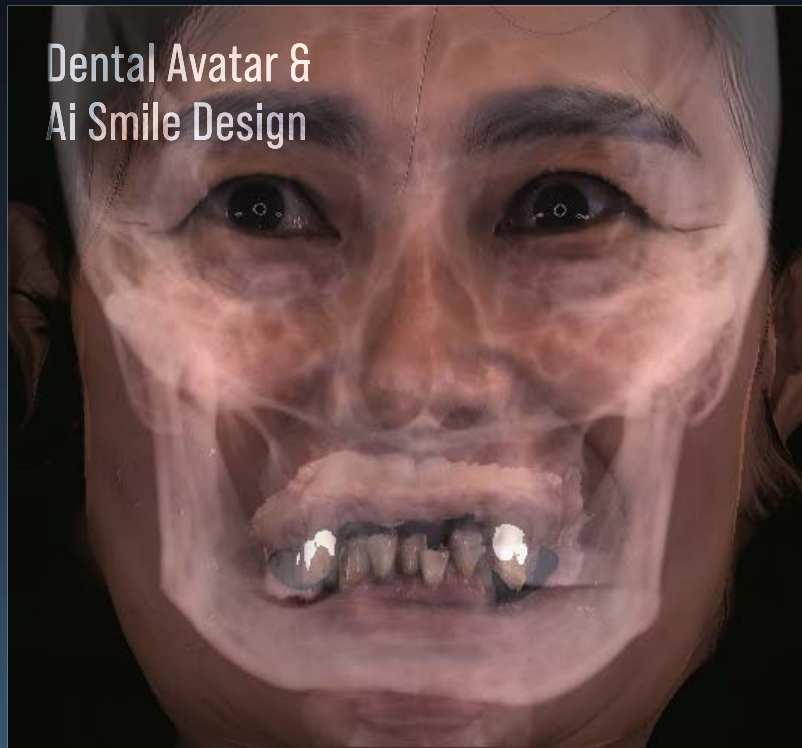
Dental Avatar & Ai Smile Design

“How was the VD determination and treatment planning for edentulous cases completed?”