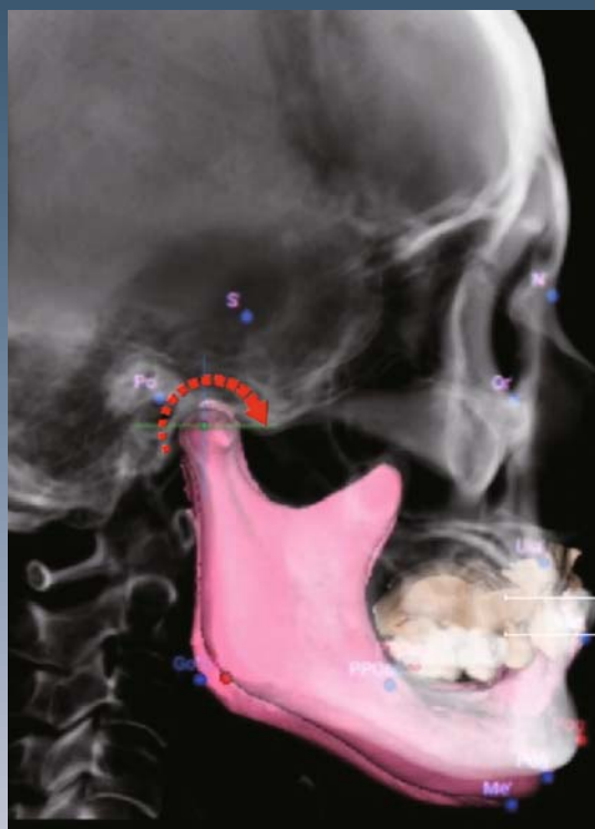
Original position Changed position