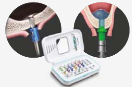
CAS-Kit Crestal Approach