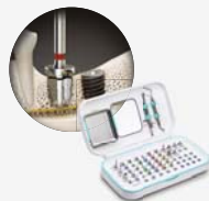
485-Kit Kit for Short Implants