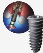
TS IV Implant Tapered Implant