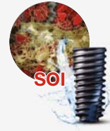
TS SOI Implant Bioactive Surface