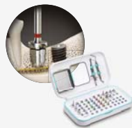
485-Kit Kit for Short Implants