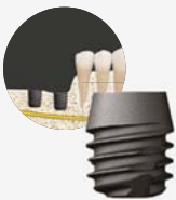
TS Short 4-6 mm Implant