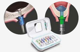
CAS-Kit Crestal Approach