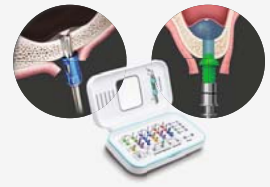
CAS-Kit Crestal Approach