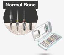
122 Taper-Kit Simple Drilling Sequence