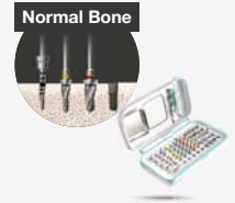
122 Taper-Kit Simple Drilling Sequence