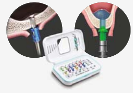
CAS-Kit Crestal Approach