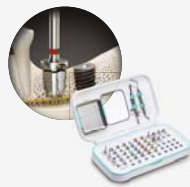
485-Kit Kit for Short Implants