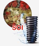
TS SOI Implant Bioactive Surface