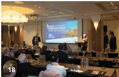
Impressions from the 20 th Expert Symposium