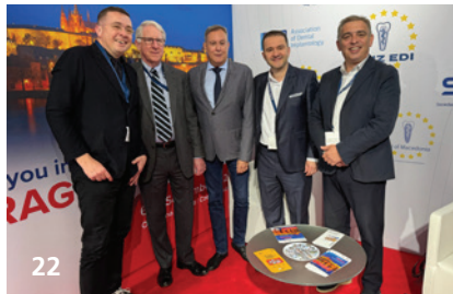
BDIZ EDI at IDS 2025