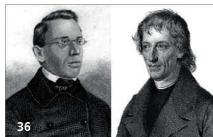
36 Important German dentists in Prague