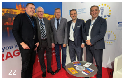
22 BDIZ EDI at IDS 2025