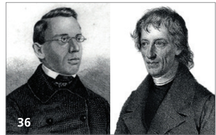
Important German dentists in Prague