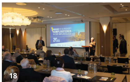
18 Impressions from the 20 th Expert Symposium