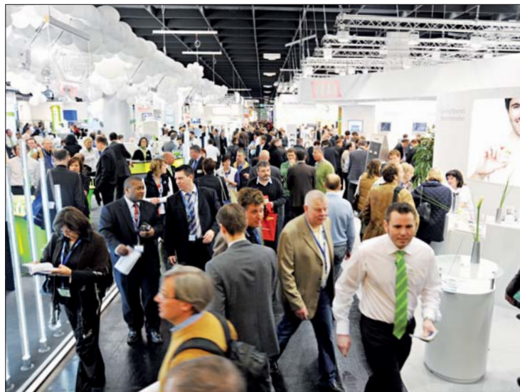
Visitors swarm one of the halls at IDS Cologne 2009.

"The great level of participation from all over the world is attribut-