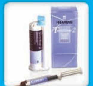
Temp Crown & Bridge