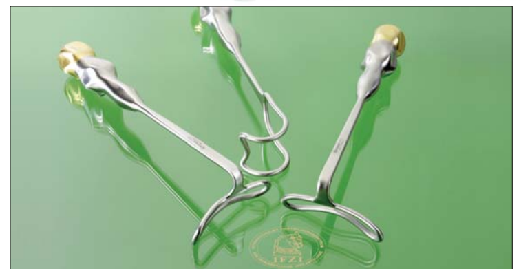
Kohler's new lip and cheek retractors can be equally used for the upper and lower jaw.

At IDS, Kohler will also showcase newly designed cheek retractors, consisting of two side and one front retractor. They can be equally used for the upper and lower jaw. Similar to the the com-