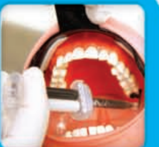
Mojo™ : Unidose Impression Mat.