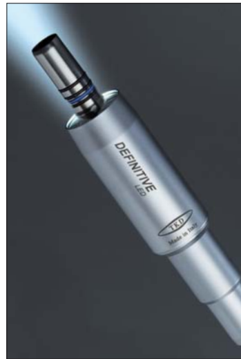
• Tekne Dental

Founded in 1989, Simbios aims to promoting its member companies' products abroad and supporting with international market contacts by offering foreign buyers a wide range of dental products and applications. Nowadays, the company is seen by foreign dealers as a single partner offering a wide range of dental products