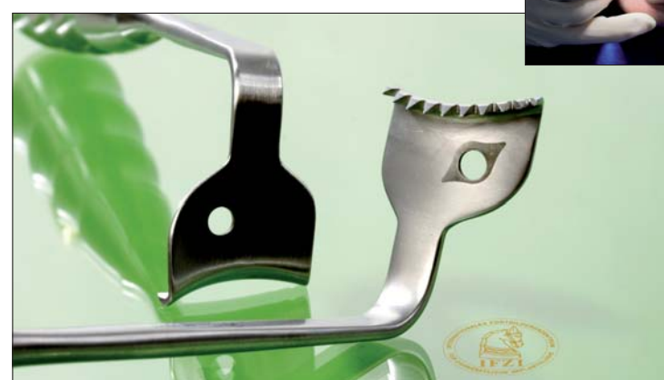
The sinus retractor has "shark teeth" that secure the mucoperiosteal flap.

During lateral sinus window preparation, this new instrument secures the mucoperiosteal flap by holding it through "shark teeth". Therefore, pressing the retractor firmly against the jaw bone is no longer necessary. This also benefits the lifting the sinus membrane and bone augmentation with or without simultaneous implant placement, the company says. In addition, the shape of the instrument end prevents the instrument from sliding into the sinus window. Only moderate retraction force is required from the assistant due to an anatomical shaped handle.