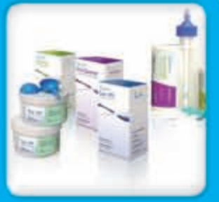
VPS Impression Material