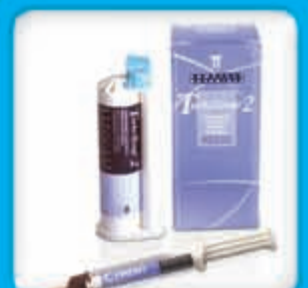
Temp Crown & Bridge