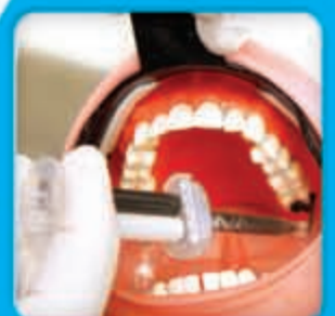
Mojo™ : Unidose Impression Mat.