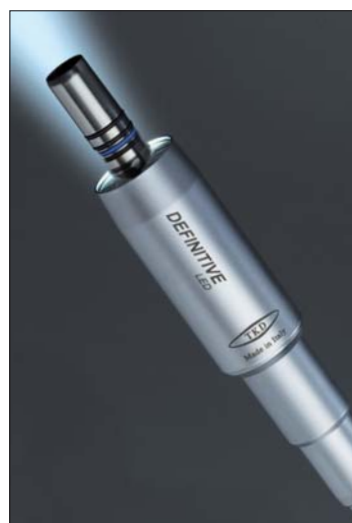
• Tekne Dental

Founded in 1989, Simbios aims to promoting its member companies' products abroad and supporting with international market contacts by offering foreign buyers a wide range of dental products and applications. Nowadays, the company is seen by foreign dealers as a single partner offering a wide range of dental products