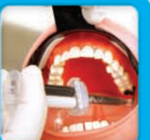
Mojo™ : Unidose Impression Mat.