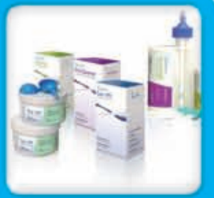
VPS Impression Material