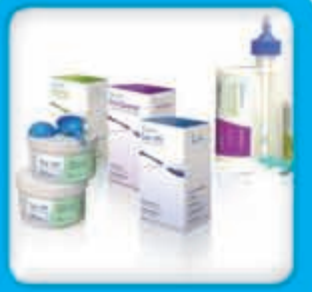
VPS Impression Material