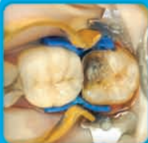
Sectional Matrix Systems