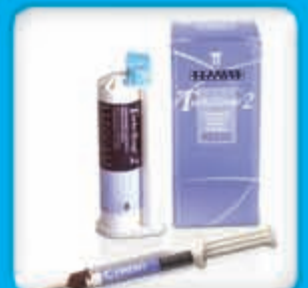
Temp Crown & Bridge