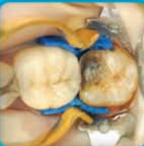
Sectional Matrix Systems