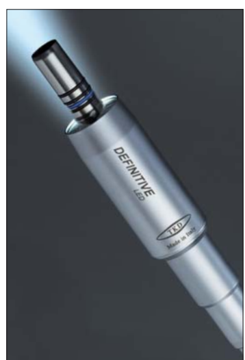
• Tekne Dental

Founded in 1989, Simbios aims to promoting its member companies' products abroad and supporting with international market contacts by offering foreign buyers a wide range of dental products and applications. Nowadays, the company is seen by foreign dealers as a single partner offering a wide range of dental products