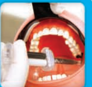
Mojo™ : Unidose Impression Mat.