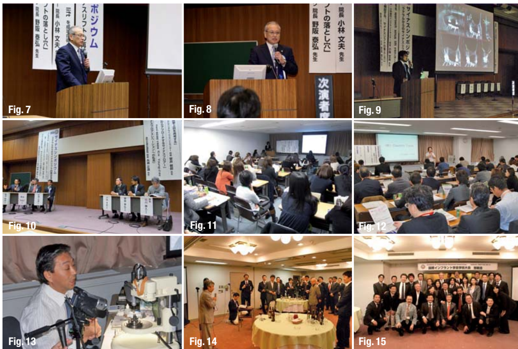
Figs. 7 & 8 _Announcement from President of AIAI to many people. Figs. 9 & 10 _Sinus symposium. Figs. 11 & 12 _Lectures for hygienists and dental technicians. Figs. 13 _The seminar of the hands on for dental technician also was hold in other room. Figs. 14 & 15 _Social Gathering Party.

Many friends and colleagues of AIAI will take part, too because it will be possible to have Japanese simultaneous interpretation for the lectures. In addition, he called to the AIAI-members which are having authority or a clinical certificate of AIAI in Japan, to become Expert and Specialist of DGZI. In Germany and in Japan it is so venerable to hold such a certificate of DGZI.