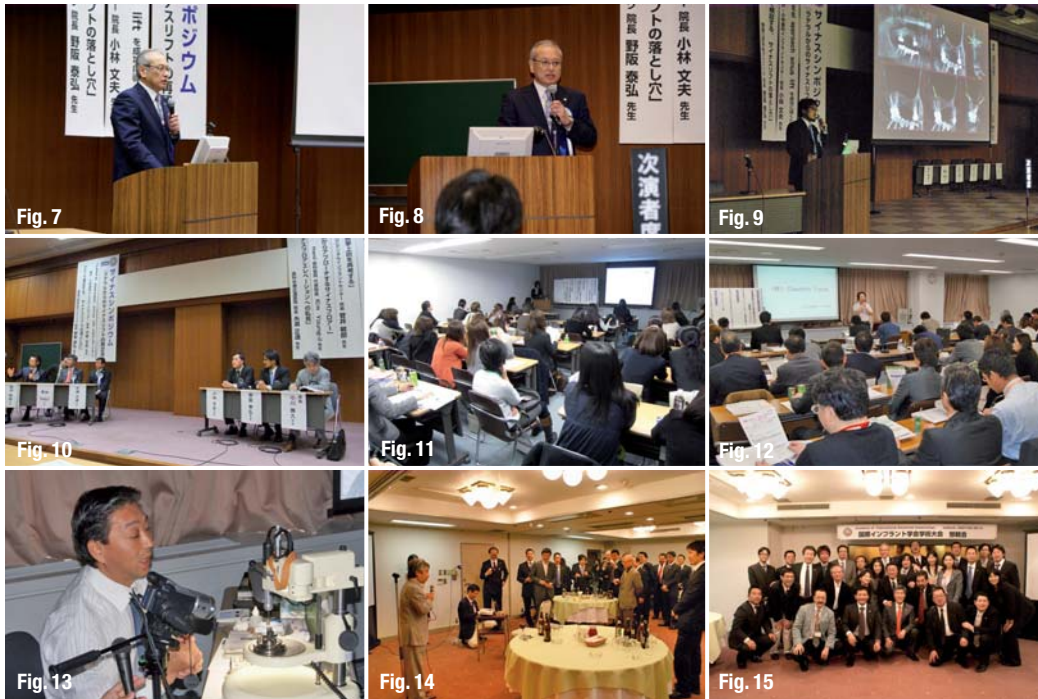
Figs. 7 & 8 _Announcement from President of AIAI to many people. Figs. 9 & 10 _Sinus symposium. Figs. 11 & 12 _Lectures for hygienists and dental technicians. Figs. 13 _The seminar of the hands on for dental technician also was hold in other room. Figs. 14 & 15 _Social Gathering Party.

Many friends and colleagues of AIAI will take part, too because it will be possible to have Japanese simultaneous interpretation for the lectures. In addition, he called to the AIAI-members which are having authority or a clinical certificate of AIAI in Japan, to become Expert and Specialist of DGZI. In Germany and in Japan it is so venerable to hold such a certificate of DGZI.