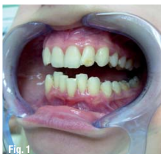
Fig. 1 _ Clinical appearance of the affected 22 tooth. Figs. 2 a & b _ Laser preparation and etching with Er:YAG laser LiteTouch (Syneron, Israel) by "Hard tissue mode" (400 mJ/20 Hz; 8.00 W). View of air dried laser treated surface with "frosted" appearance.

The successful bonding of resins to teeth may be very dependent on the response of the enamel to acid etching. 9 Due to abnormal enamel the standard etching time and/or concentration of acid may not be appropriate for abnormal enamel. 9 Studies have shown that the hypomineralized enamel did not exhibit the typical etching pattern seen in control enamel. 7,9 Upon etching, there may be a uniform removal of hypomineralized enamel, rather than the differential etching patterns seen in the unaffected control enamel. 7,9 This etching of a less