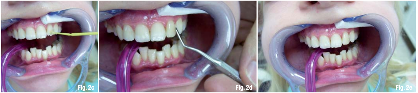
Fig. 2 c & d _ Adhesive agent application and final restoration view.

organized enamel structure may result in a pattern that is not the classic etched pattern, which may have a detrimental effect on bonding between the restorative/adhesive materials and the affected enamel. 7 For that reason the dentist would like to find an alternative procedure for preparing the hypoplastic enamel. One of the effective methods may be to etch the hypoplastic enamel with Er:YAG lasers.