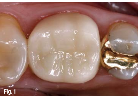
Fig. 1 LS 2 crowns after the two-year recall visit.

In 1985, Prof Werner Mörmann, Dr Marco Brandestini and their team laid the foundations for a new treatment system consisting of optical impression-taking, CAD and numerically controlled milling. This new concept motivated large numbers of clinicians and prompted them to carry out their own follow-up investigations. Today, CEREC is one of the most closely scrutinised dental procedures, a fact reflected in more than 250 clinical studies and approximately 6,500 longitudinal studies of restorations.