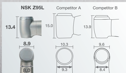
The Smallest and Slimmest in the World