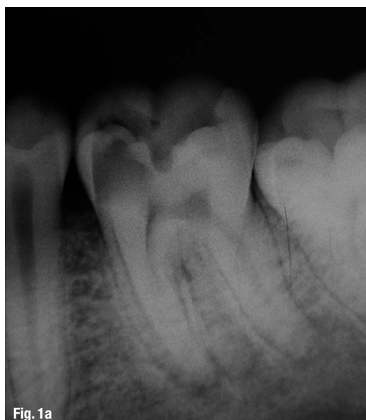
Figs. 1a & b _Root-canal treatment on a three-rooted MFM: pre-op radiograph (Fig. 1a); post-op radiograph (Fig. 1b).

Based on the above information, our group recently published a systematic review on root anatomy and canal configuration of the permanent MFM with reference to 41 studies and a total of 18,781 teeth. 17 A summary of the data obtained is presented in Table I. This review provided significant information directly related to our clinical procedures.