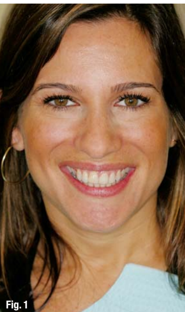
Fig. 1 _ Visualising the entire oral-facial composition helps to diagnose less harmonious features of the smile.