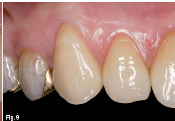
Figs. 8 & 9 One week after insertion of the ceramic crown on tooth #13 the gingiva appears to be free of irritation. The marginal fit is tight and the transition cannot be seen with the naked eye. The natural colour of the ceramic is not influenced by CLEARFIL SA CEMENT.

away and can be coagulated slightly by applying a polymerisation lamp for two to five seconds, depending on the lamp's power, so that it can be easily removed with an instrument, usually in one piece (Fig. 5). It is important that while removing the excess material, the crown be held fast in its final position.