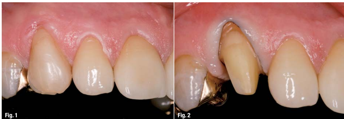
Fig. 1 _Initial situation. Tooth #13 with approximal caries, apical osteitis and poor cervical restoration. Prosthetic provision planned after endodontic treatment.

CLEARFIL SA CEMENT is a self-adhesive, dual-curing composite cement for the cementation of indirect restorations, such as crowns and bridges; inlays and onlays made of metal, ceramic and composite; as well as root-canal posts. The material is applied directly from the