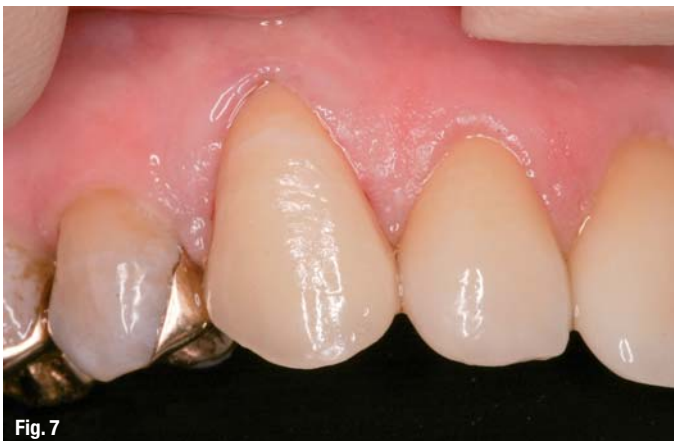
Fig. 7 Situation directly after insertion of restoration and removal of retraction cord.

Prior to definitive stump preparation, the provisional distal and cervical crown parts received adhesive build-up fillings. For the restoration, we used the universal composites CLEARFIL MAJESTY Esthetic and CLEARFIL MAJESTY Flow. The self-etching, two-step adhesive CLEARFIL SE BOND was used for the adhesive pre-treatment of the dentine. The preparation was completed and the colour of the crown defined using a VITA shade guide.