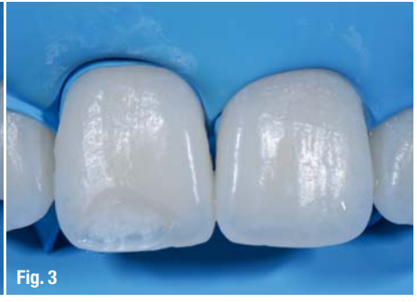
Fig. 1_Pre-op situation. Fig.2_Absolute isolation of the operating field with a rubber dam is the ideal form of moisture control. Fig. 3_Preparation of a small circular chamfer.

_The new generation of resin composite materials in combination with modern layering techniques allows today's practitioners to treat their patients with minimally invasive, highly aesthetic direct restorations. Owing to their enhanced properties, these materials produce results that are hardly distinguishable from natural dentition, especially with regard to colour, which is particularly desirable in anterior teeth.