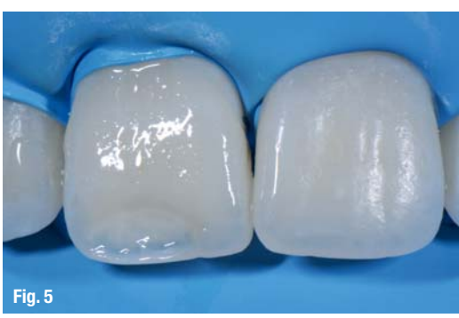
Fig. 4_Etching with 37 % phosphoric acid. Fig. 5 Application of the adhesive.