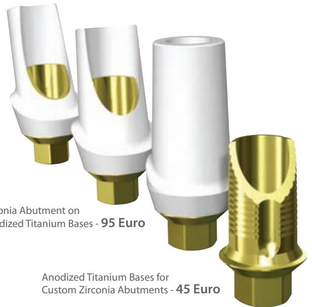
Zirconia Abutment on Anodized Titanium Bases - 95 Euro