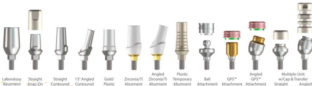
Laboratory Abutment, Straight Snap-On, Straight Contoured, 15° Angled Contoured, Gold/Plastic, Zirconia/Ti Abutment, Angled Zirconia/Ti Abutment, Plastic Temporary Abutment, Ball Attachment, GPS™ Attachment, Angled GPS™ Attachment, Multiple-Unit w/Cap & Transfer Straight, Angled