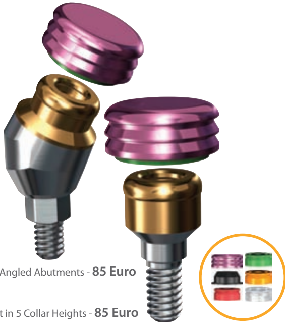
15° & 30° Angled Abutments - 85 Euro