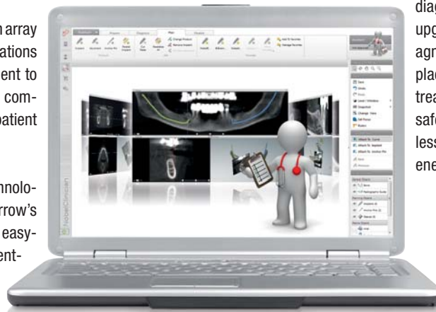
Treatment planning with the new NobelClinician software.

and treatment planning, guided implant surgery and CAD/CAM dental prosthetics. Together, they enhance clinicians' skills, improve patient care and deliver long-lasting results. As a pioneer in digital dentistry, Nobel Biocare supports dental professionals with a more efficient, predictable,