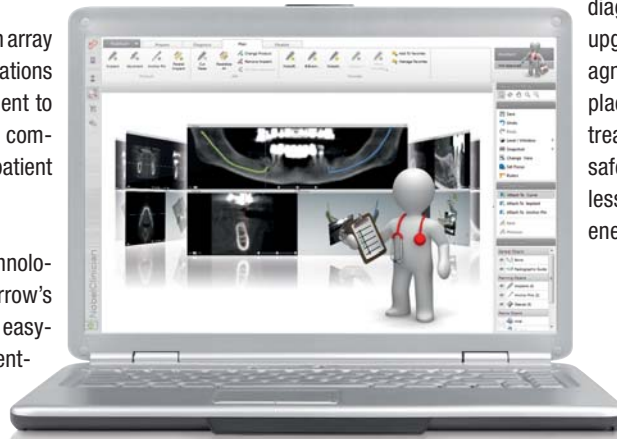
Treatment planning with the new NobelClinician software.

and treatment planning, guided implant surgery and CAD/CAM dental prosthetics. Together, they enhance clinicians' skills, improve patient care and deliver long-lasting results. As a pioneer in digital dentistry, Nobel Biocare supports dental professionals with a more efficient, predictable,