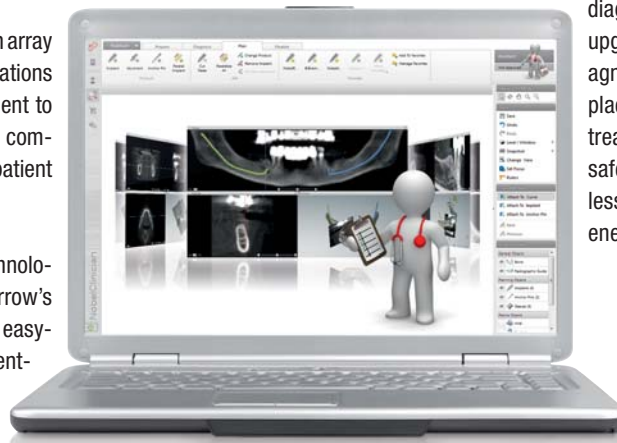
Treatment planning with the new NobelClinician software.

and treatment planning, guided implant surgery and CAD/CAM dental prosthetics. Together, they enhance clinicians' skills, improve patient care and deliver long-lasting results. As a pioneer in digital dentistry, Nobel Biocare supports dental professionals with a more efficient, predictable,