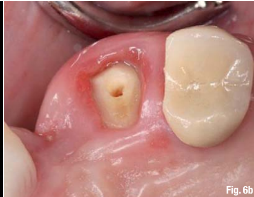
Figs. 6a & b Post and crown loosened from maxillary canine a few months after placement. Both the core/prefabricated post and the crown came off (a). Clinical photograph shows the absence of cervical tooth structure (ferrule) for retention of the crown (b).