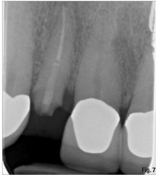
Fig. 7 A radiograph of a fractured maxillary lateral incisor with a glass fibre post.