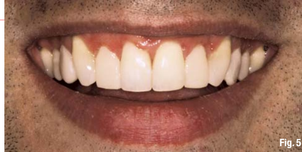
Fig. 4 Full-face with mock-up of teeth #7 and 10.