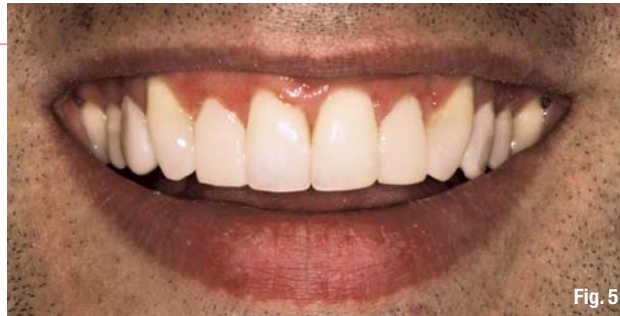
Fig. 4 Full-face with mock-up of teeth #7 and 10.