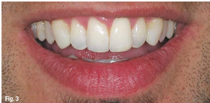
Fig. 3_Pre-op close-up, after canines were bonded.

by the bonding (Fig. 3). That was about three years ago.