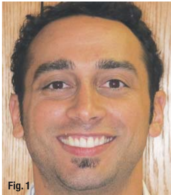
Fig. 2_Pre-op close-up, retracted.