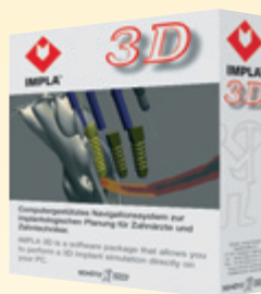
IMPLA™ 3D Navigation