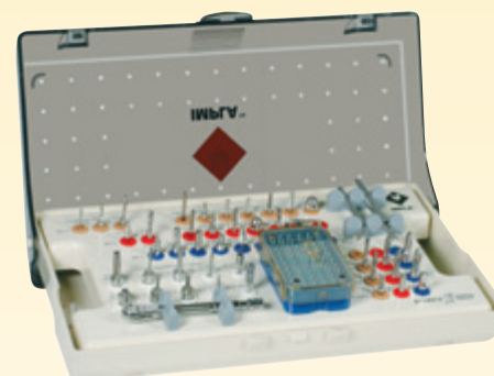
IMPLA™ surgery box The all-round box

For more information visit our homepage www.schuetz-dental.com or request our catalog!