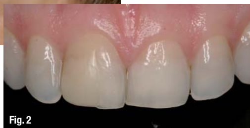
Fig. 2 _ Close-up photography is essential to planning peri-restorative care.

chronology of final restorative care, but also delays the patient's ultimate satisfaction and happiness for a minimum of two to three months. Fortunately, dental lasers have evolved considerably as an adjunctive and alternative treatment to safely, conservatively, and reliably decrease bacterial levels and improve the hard and soft tissue contours. Studies of Er:YSGG lasers by Rizioiu and others have shown that thermal coagulative results, as