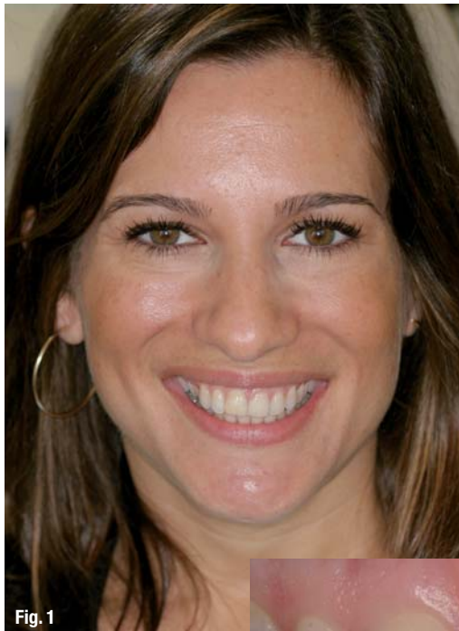
Fig. 1 _ Visualizing the entire oral-facial composition helps to diagnose less harmonious features of the smile.