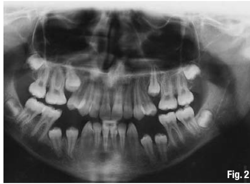
Fig. 2 Panoramic view taken on December 2008: The bone-level and soft-tissue lines are all normal. There is no pathological finding reportable.

In this study, additional to complete clinical, radiological, pathological and genetic diagnosis, a laser-assisted periodontal therapy was performed on a PLS