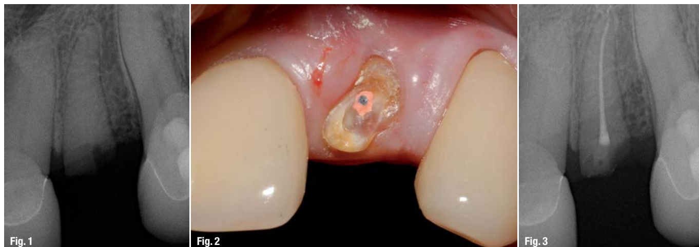
Fig. 1 _Single-tooth radiograph showing the fractured tooth #22.