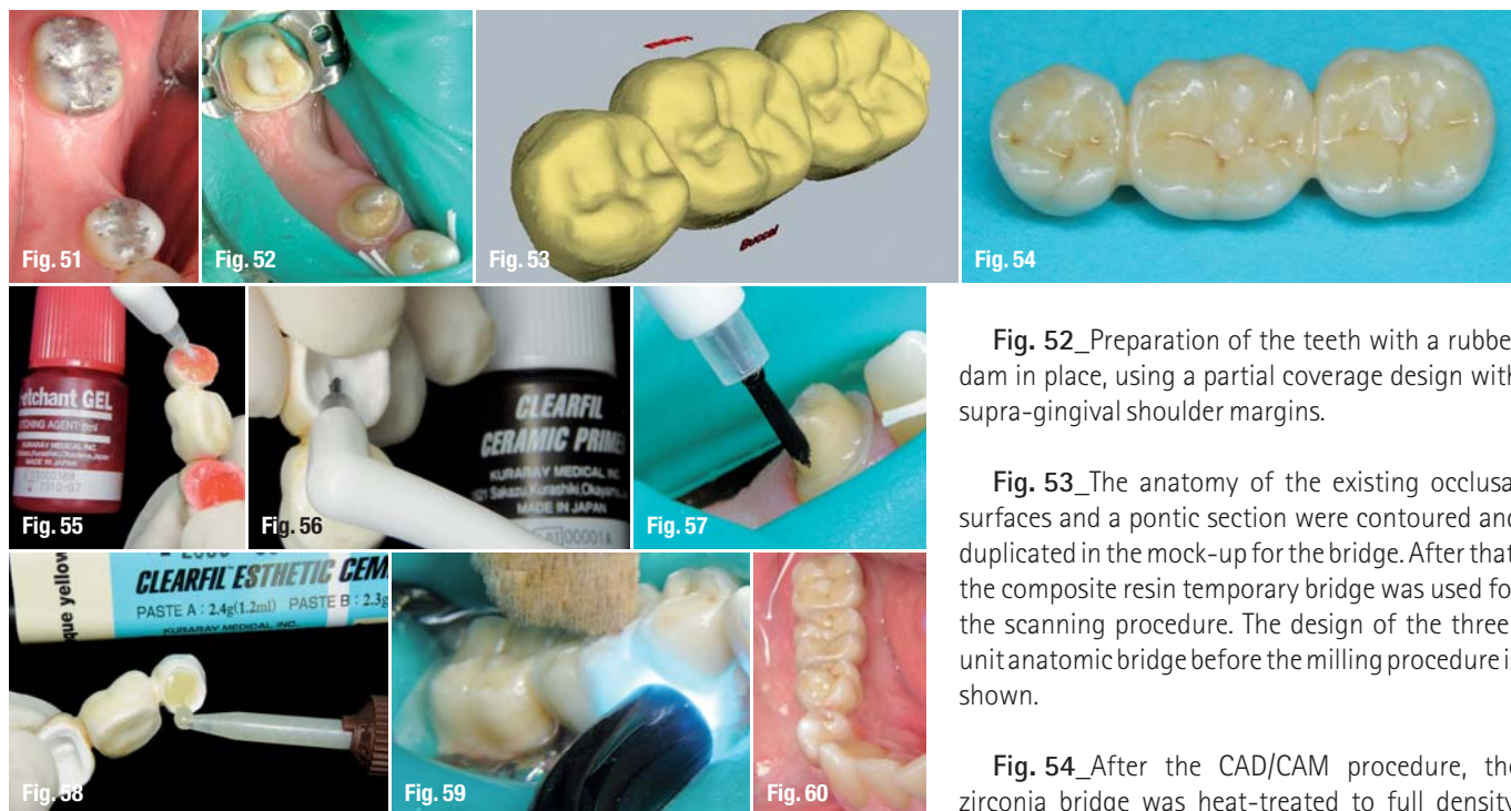
Fig. 52 _Preparation of the teeth with a rubber dam in place, using a partial coverage design with supra-gingival shoulder margins.