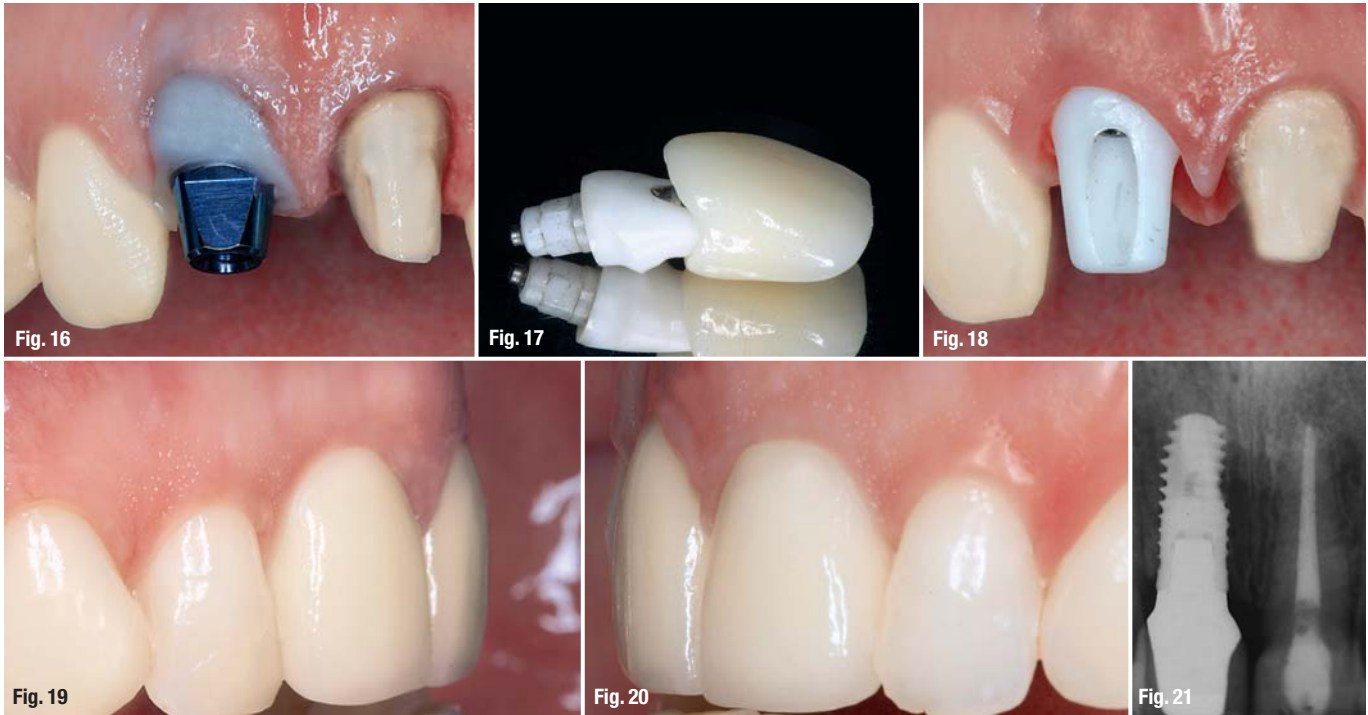
Fig. 16 Impression for the prepared natural tooth and the XiVE S plus implant.