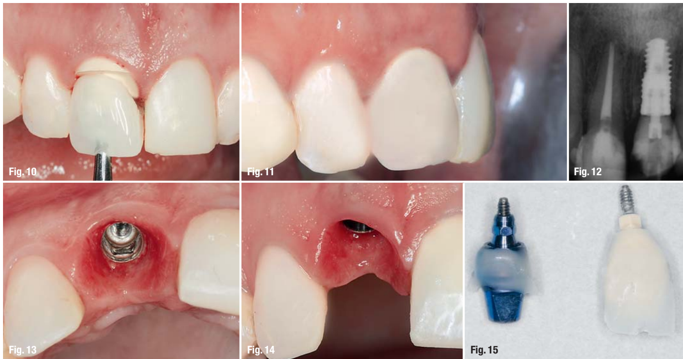
Fig. 10 Implant-supported, screw-retained provisional restoration. Fig. 11 Clinical situation one week post-implant placement. Fig. 12 Corresponding X-ray. Fig. 13 Occlusal view of the soft-tissue contour at the end of osseointegration. Fig. 14 Facial view of the soft-tissue contour at the end of osseointegration. Fig. 15 Impression coping customised in the cervical area to match the emergence profile of the provisional crown.

at all stages of the treatment. Before the start of the surgical treatment, initial impressions were taken with alginate. Study models were fabricated based on these and then mounted on a semi-adjustable articulator. A detailed wax-up was made for tooth #11 and a provisional crown was fabricated from heat-polymerised acrylic resin. The provisional crown was trimmed at the interior surfaces for use with a provisional implant abutment.