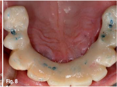
Fig. 8 Cemented bridge with occlusal loading at time of surgery.