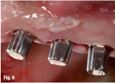
Fig. 6 Three of the six implants after three months of occlusal loading with a cemented provisional bridge.