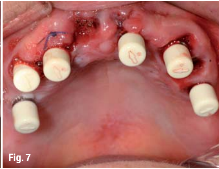
Fig. 7 Six implants inserted in the maxilla and ready for cemented bridge.