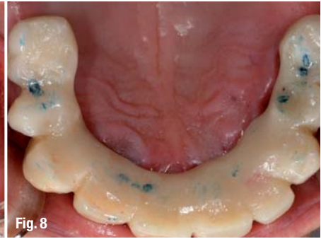
Fig. 8_ Cemented bridge with occlusal loading at time of surgery.