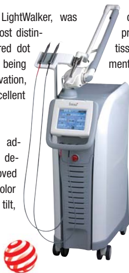
reddot design award winner 2012

LightWalker's technologically advanced, modern and functional design offers ease-of-use and improved ergonomics: A state of the art color touch screen with an adjustable tilt, interchangeable optics for new technologically advanced hand pieces, and a modern, durable and lightweight system housing allow user-friendly handling. An easy-to-access water reservoir and the unique and patented OPTOflex articulated arm, which allows a full range of motion, provide further