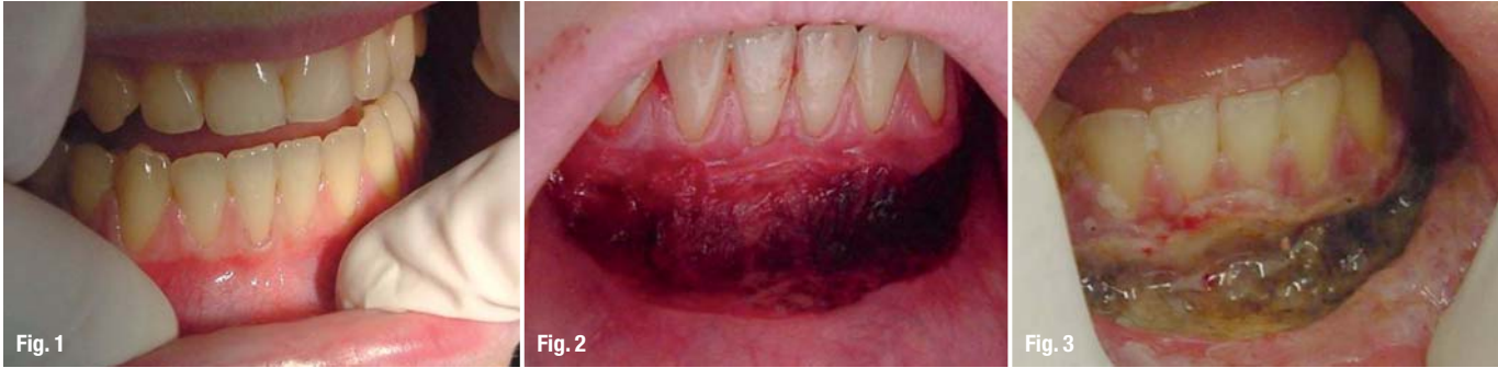
Fig. 1 Long-term case of vestibuloplasty. Situation on 15 th of June, 2003: no gingiva attached at the lower jaw front.