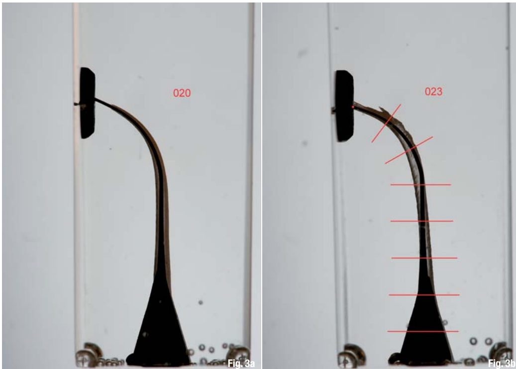
Fig. 3a, b A plastic block instrumented with WaveOne (#020) and another after hand instrumentation (#023). In the middle, the dark/black area indicates the original canal and the surrounding grey silhouette shows the root-canal geometry after shaping. With WaveOne, a sharp, continuous and smooth shape was created. In contrast, a canal instrumented with a hand file is disrupted and has a more transported shape with zipping and ledging.

Germany, were given the opportunity to work with the WaveOne primary file (25.08). These students have little experience with root-canal treatment because they only work on six teeth (two incisors, two bicuspid and two molars) and a plastic block during their sixth term. Instrumentation is taught through the initial use of hand files up to #15 for creating a glide path and using ProTaper or FlexMaster in a constant rotary motion with the ATR motor.