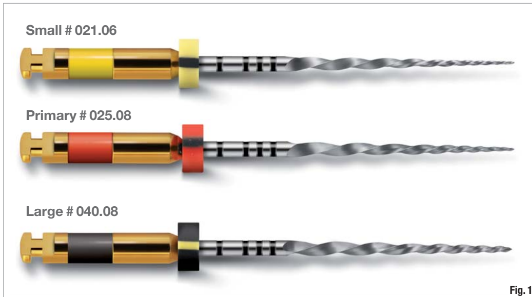
Fig. 1 WaveOne files: Small, primary and large.

With these facts in mind, Roane et al. published another article in the following year, describing the 'balanced force' concept for instrumentation of curved canals, in which they state: "Its concepts use force magnitudes in order to create control over undesirable cutting associated with canal curvature. Rotation is promoted as the means for maintaining magnitude as a control and CCW direction of rotation provides finite operator control." 2 They thus suggested combining CW and CCW motion in root-canal instrumentation to prevent breakage of K-files and preserve curved canals much better than before. To obtain this result, they introduced a new K-type file with a parabolic tip, expecting that the load would be distributed and reduced to below the regular cutting magnitude.