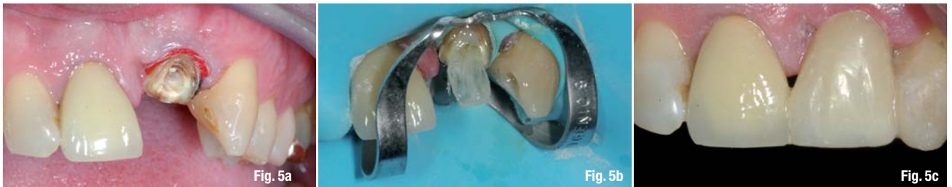
Case 1: Endodontic retreatment of an upper lateral incisor and restoration with direct FRC post and core (time in mouth since completion: 22 months)