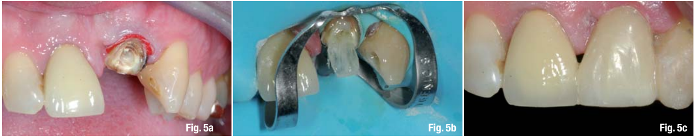
Case 1: Endodontic retreatment of an upper lateral incisor and restoration with direct FRC post and core (time in mouth since completion: 22 months)