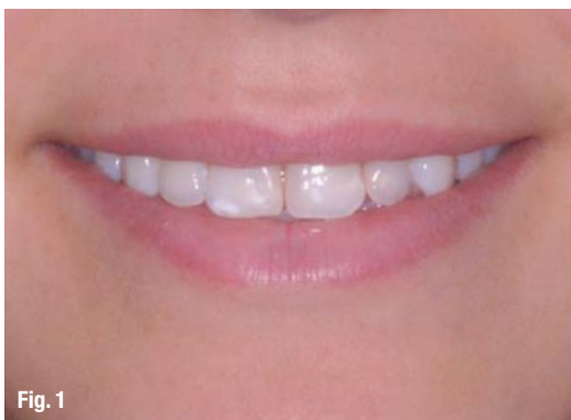
Fig. 2 _Stained teeth, old composite fillings and rotated teeth were the patient's major complaints.