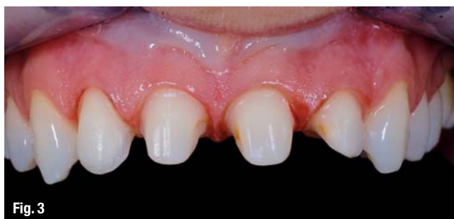
Fig. 3 _Prepared teeth for two crowns and two veneers.

Now, skilled dental technicians can press lithium disilicate restorations as thin as 0.3 mm with excellent aesthetic results. If we add to that experience and knowledge of the material, such restorations could be considered perfect in terms of appearance, durability and ability to blend with the existing intact teeth.