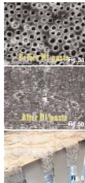
Fig. 5a & b ACP forms a mineral barrier of hydroxyapatite, which occludes the exposed dentinal tubules.

Editorial note: A complete list of references is available from the publisher.