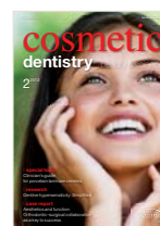
Cover image courtesy of BestPhotoStudio.