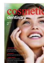
Cover image courtesy of BestPhotoStudio.