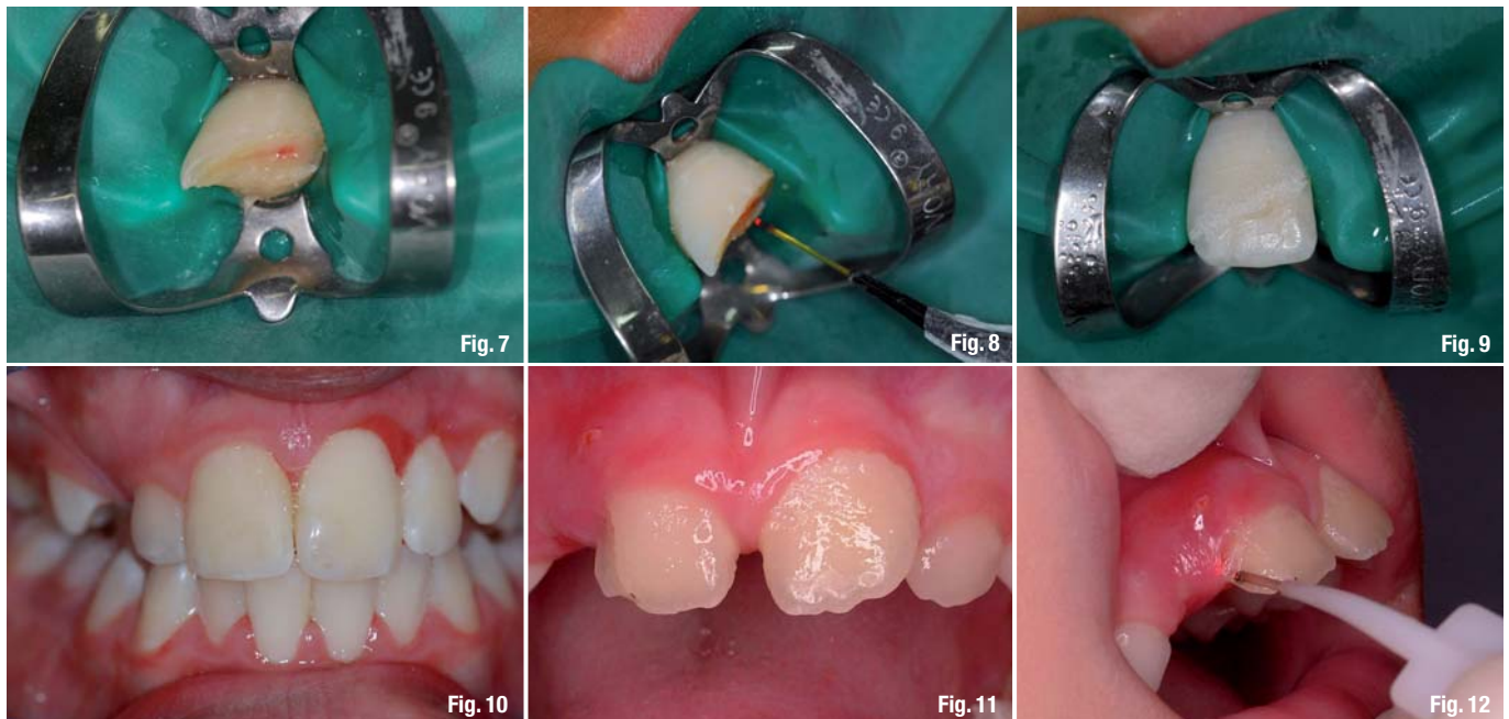
Fig. 7 Exposed pulp.