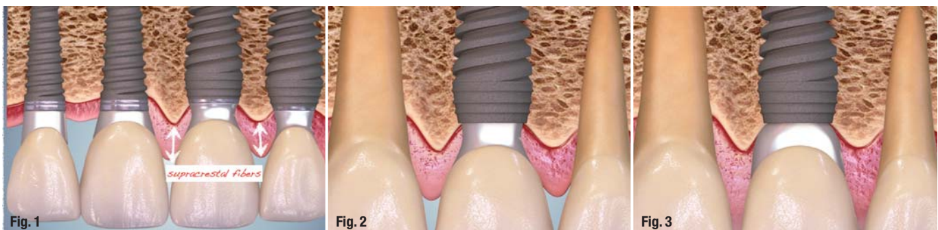
Fig. 3 _Convex profile of the final individual abutment.