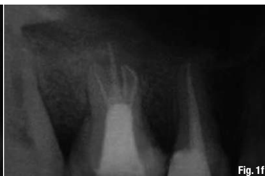
Figs. 1e & f _ Immediate post-op radiograph (e) and follow-up radiograph at 24 months, showing periapical healing (f).