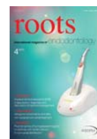
Cover image courtesy of Bisico, www.bisico.fr