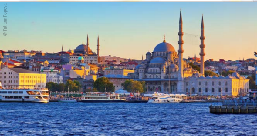
View of Istanbul. Turkey is expected to become one of the major growth markets for dental implants in Europe.

iData Research is an international market research and consulting firm focused on providing market intelligence for the medical device, dental and pharmaceutical industries. For more information and a free synopsis of the above report, please contact iData Research at dental@idataresearch.net .